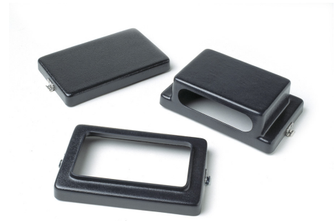
Phantom includes detachable scanning wells and air tight case.