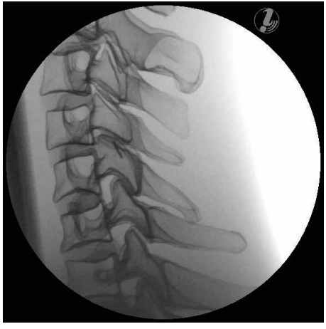
Intraarticular facet from lateral