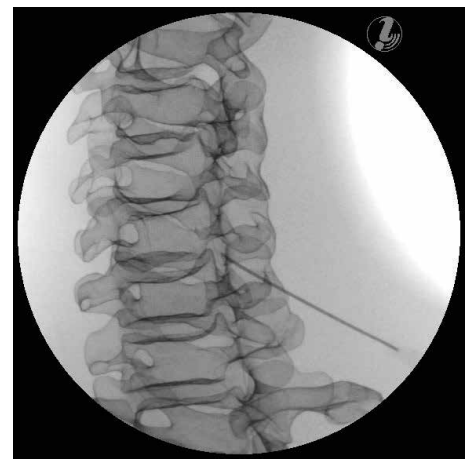
Interlaminar epidural contralateral oblique view