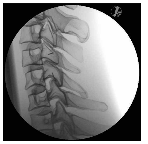
Medial branch block C4-C5

Images taken with an X-ray machine combined with an image converter.