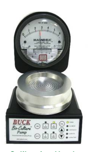
Calibration Head Attached to Pump