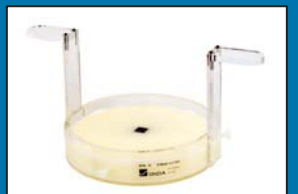
Thermal Index Mask Kit (RFB-MSK1x1)