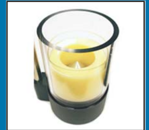
Cone target kit for Physiotherapy Up to 20W (RFB-CTK)