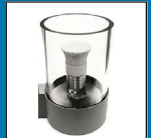
Brush target for HIFU measurements Up to 100W (RFB-BTK)