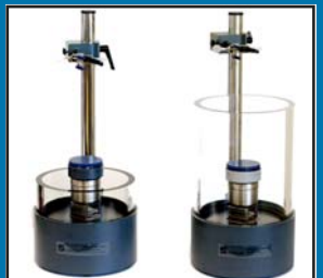
Short Tank Configuration (left) to accommodate large transducers