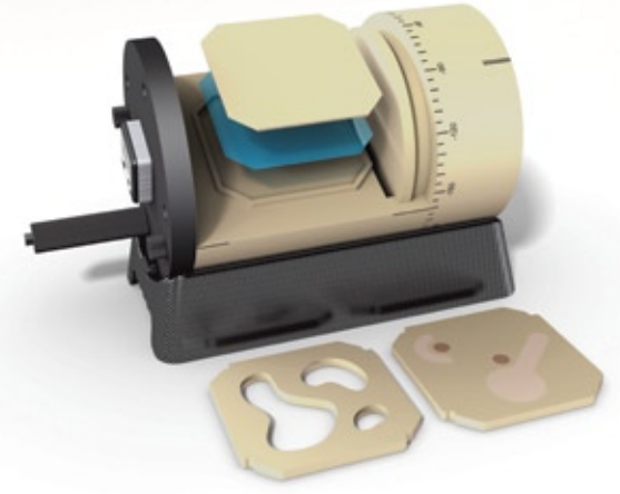
ARC QA Phantom, partially disassembled, showing various inserts

Obtain absolute dose, relative dose, and point dose dosimetry QA measurements at isocenter and at exact positions off isocenter, using standard ion chambers and film. Chamber plug system accommodates a classic Farmertype chamber, which can be positioned anywhere within a 13 cm diameter range on the axial face. Use the two included film inserts, positioned in the axial or the longitudinal orientation, which can be rotated freely in 360°.