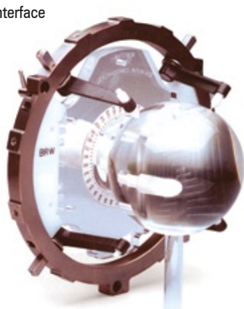
Varian / Radionics<sup>™</sup> / CRW/BRW Stereotactic Frame Interface