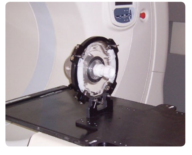
The Lucy 3D QA Phantom positioned on a TomoTherapy<sup>®</sup> couch using a Varian / Radionics<sup>™</sup> / CRW/BRW frame