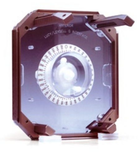
Leksell Gamma Knife® Stereotactic Frame Interface