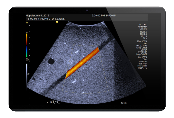
The Doppler 403 Flow Phantom is used to test the Doppler color flow velocity measurement.