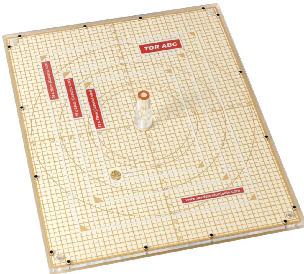
fig. 1 TOR ABC