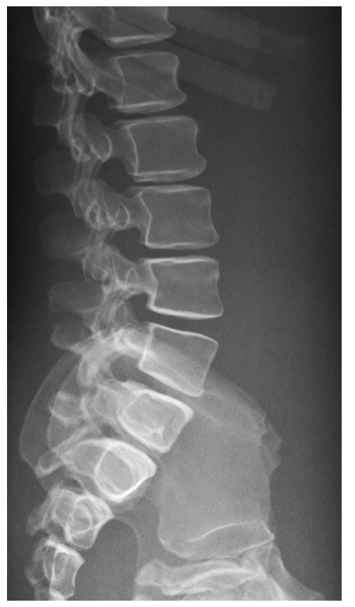
Lateral Lumbar Spine