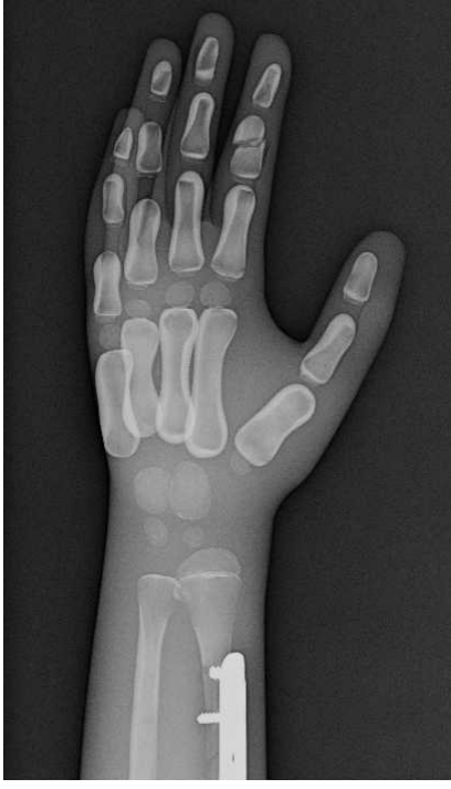
Left Oblique Hand