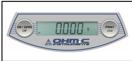
Front Display Panel