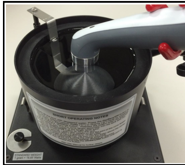
Transducer Placement Details